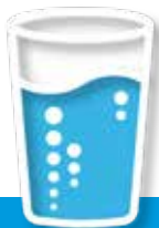
Sparkling & Flavored Water

Sparkling water with or without added flavor to allow clients to fully relax.