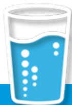
Sparkling & Flavored Water

Touchless filtered alkaline water coolers for waiting areas and medical offices